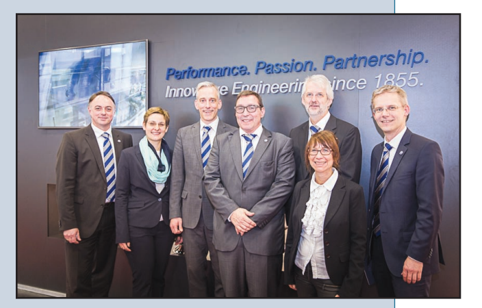
HF TireBuilingMachines Team 2015