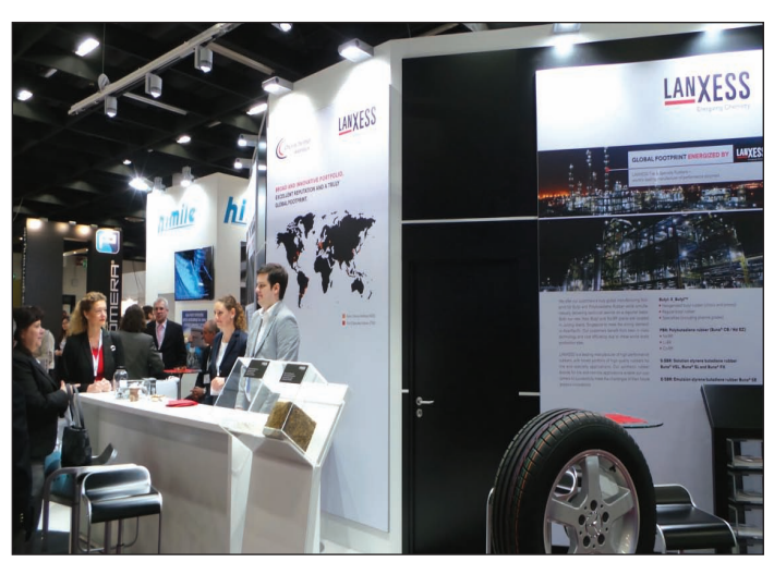
LANXESS' very good stand with RheinChemie also showcasing