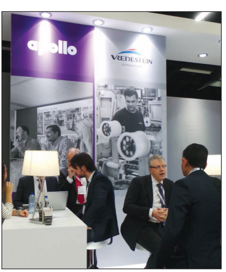
Stand of Apollo-Vredestein