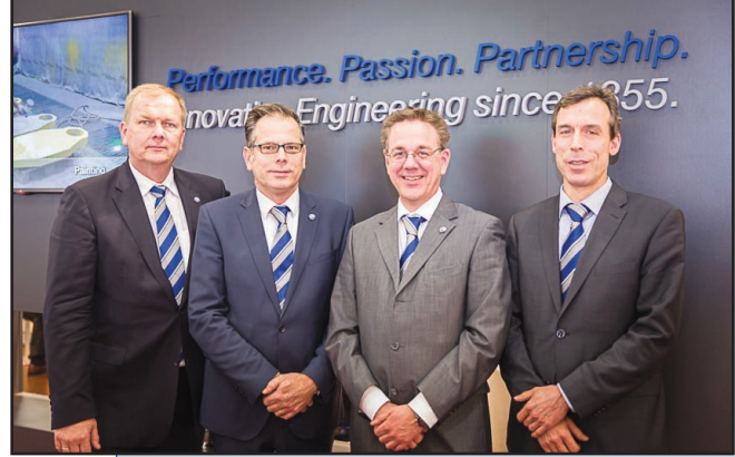
HF Extrusion Team 2015